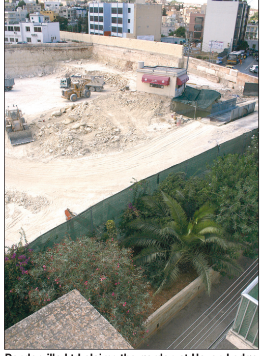
Penderville Ltd claims the garden at Haven Lodge was part of the Lm10m land deal in 2005