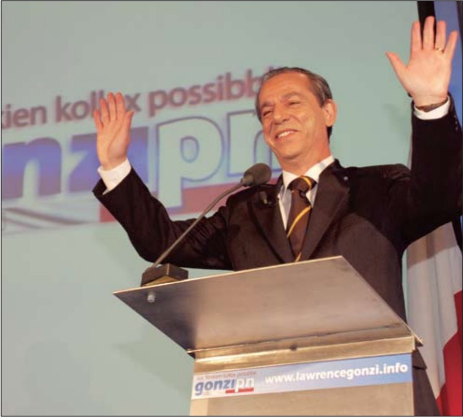
In the aftermath of Gonzi's 'backbench coup', his show of strength may have earned him vital trust points, especially from his core voters

Gonzi especially has solidified his hold among a segment of PN voters. From the respondents who voted PN