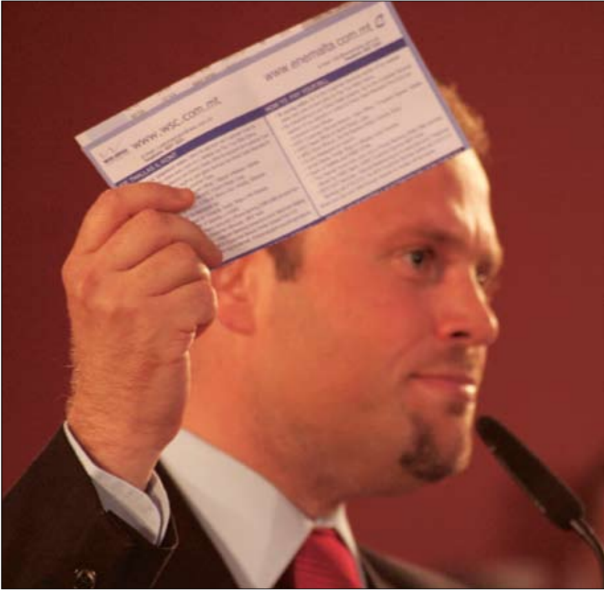
Muscat still retains the highest trust ratings, but even in the midst of the tariffs hike, Gonzi is no write-off

in 2008, the percentage who deem Gonzi's performance as Prime Minister positively has increased from 36% in September to 48% now.