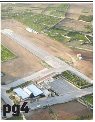
Gozo airstrip: Chamber welcomes Labour's U-turn