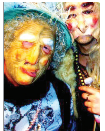
CARNIVAL 2010: When misbehaviour meets chaos