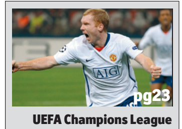
UEFA Champions League