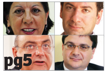
pg5 SUPERMINISTRIES - Gonzi's cabinet reshuffle analysed