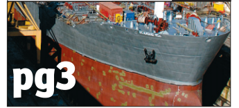
pg3 Shipyards' €5.3m profits on ship-repair in 2007