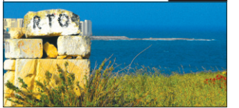
Country walkin' - Your rambling rights explained