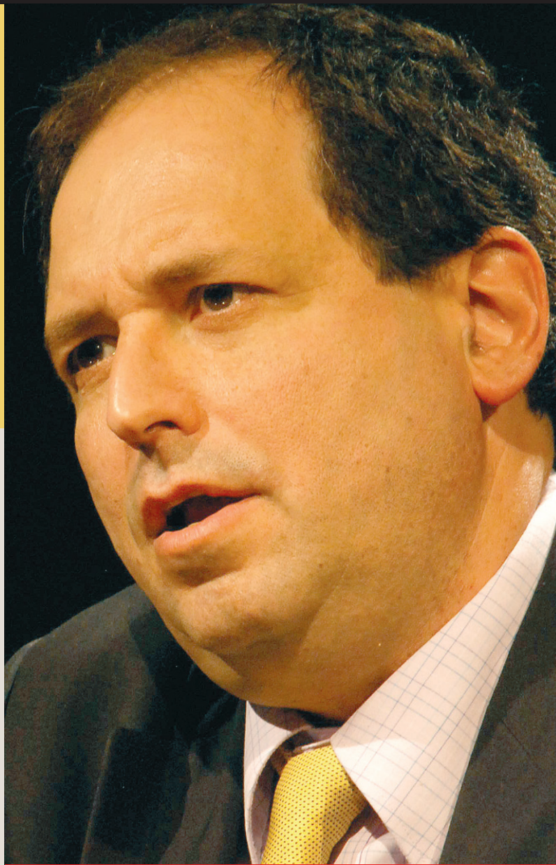
page 5 - Farrugia takes Gonzi to task

Gonzi's message then triggered a series of replies from other MPs, in defence of Farrugia's outburst.