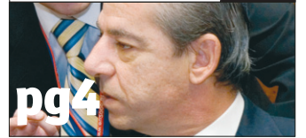
pg4 Cabinet reshuffle - Gonzi re-edits the status quo