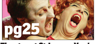
pg25 Theatre at St James: You're the one for me, fatty!