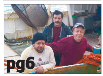
pg6 NEWS: €35,000 fine for Sicilian fisherman