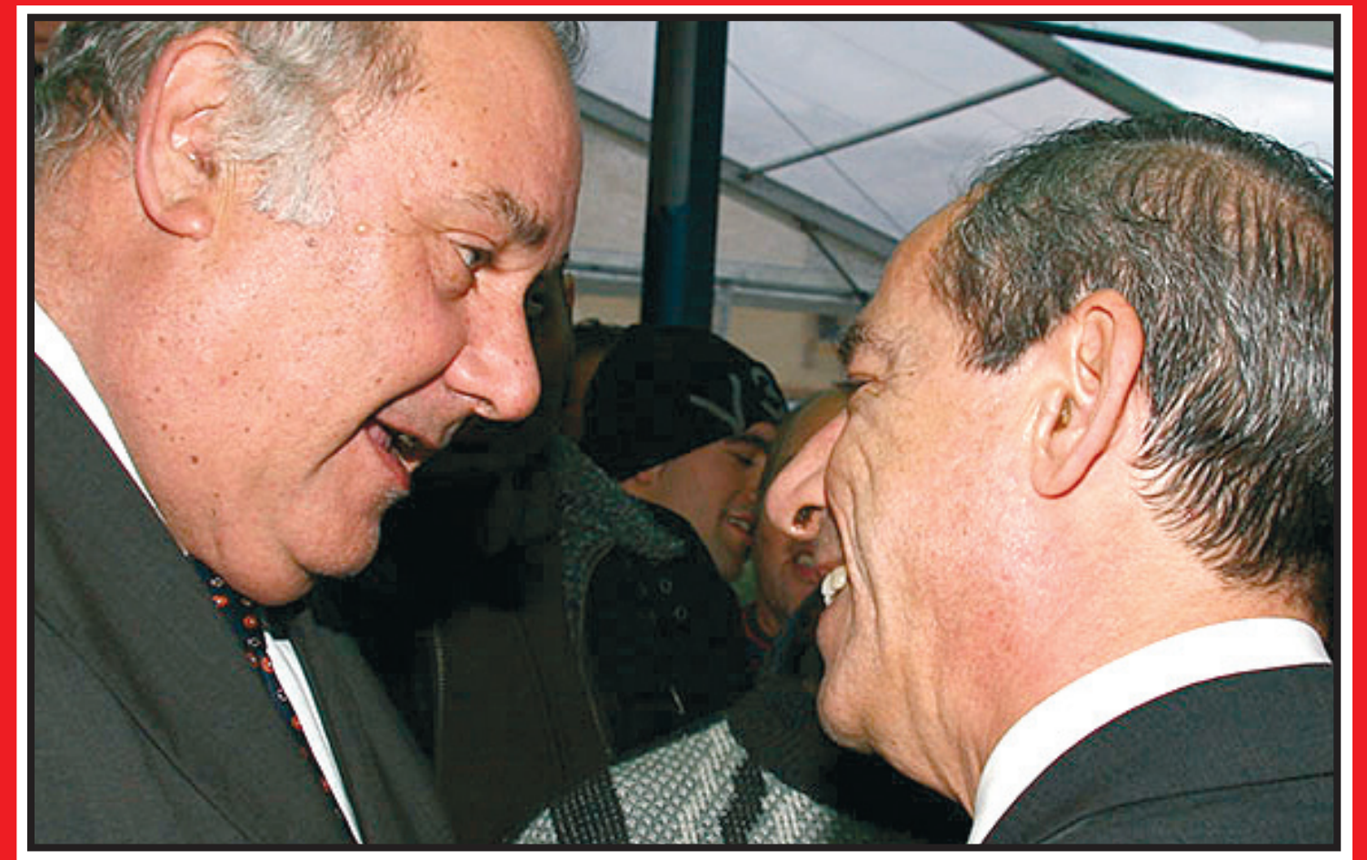
A file photograph showing Prime Minister Lawrence Gonzi (right) with former Chief Justice Noel Arrigo at a corporate function. At the time, Arrigo was awaiting trial on charges of bribery and trading in influence.

Council of Europe report: penalties for trading in influence for judges and public officers 'too low' and 'limited' page 5