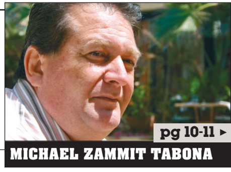
pg 10-11 ▶

Sunday, 19 July 2009 – issue 506 • www.maltatoday.com.mt