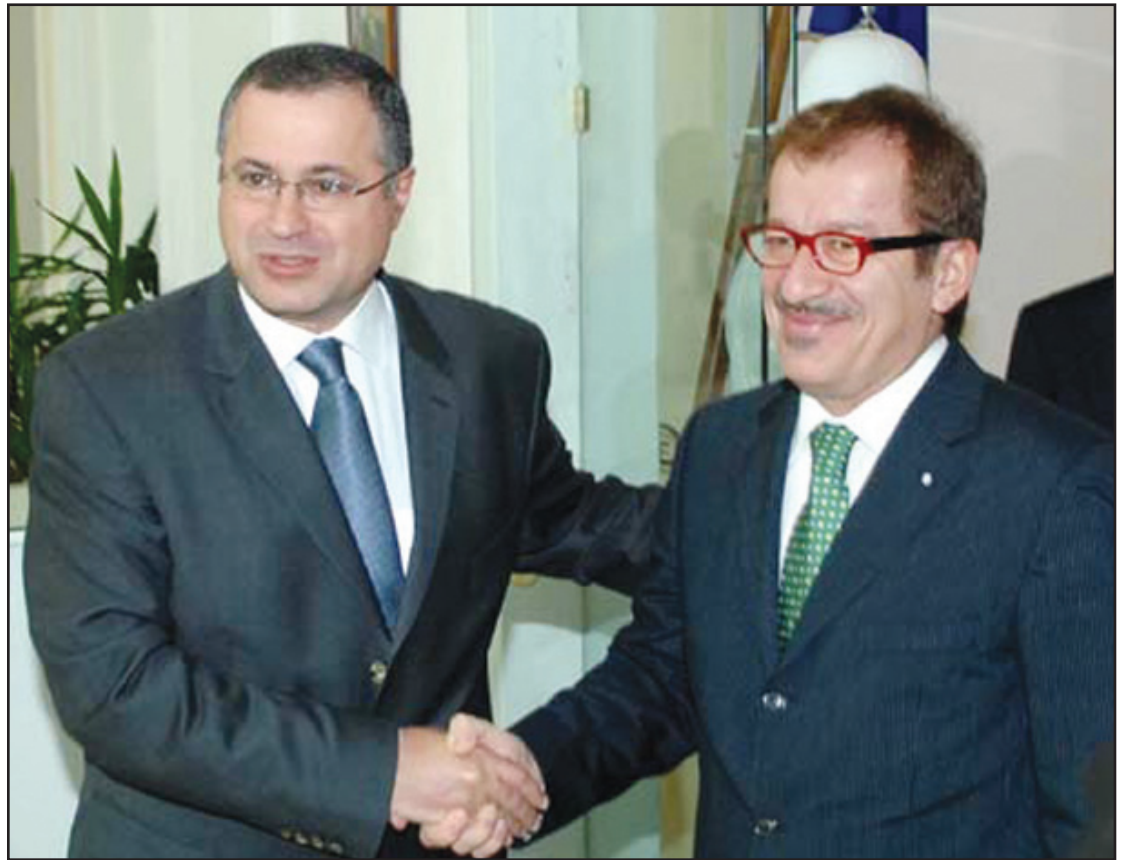
Carm Mifsud Bonnici (left) has confirmed Malta's support for Roberto Maroni's (right) forced repatriation policy after saying that Malta and Italy were now "in perfect tandem"