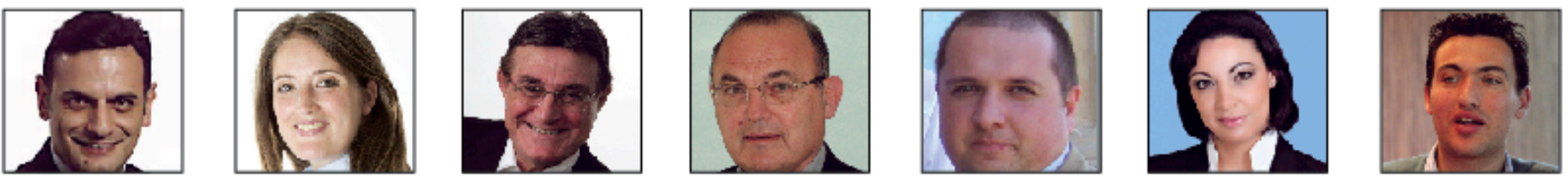
Casa Tedesco Triccas Farrugia Portelli Demicoli Portelli Deidun