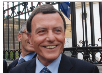
Alfred Sant, defiant as ever pg 4 ▶