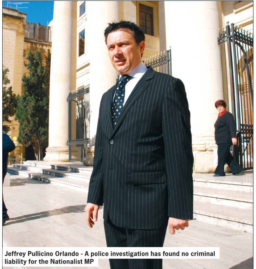
Jeffrey Pullicino Orlando - A police investigation has found no criminal liability for the Nationalist MP