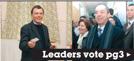
Leaders vote pg3 ►