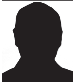
This candidate whose name is banned by court order faces money laundering charges