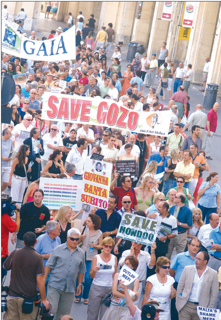
Last week's protest against the Ramla l-Hamra development. The GWU also took part in the mass demonstration against MEPA's decision