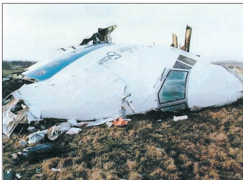
Lockerbie 1988: the debris of Pan Am Flight 103