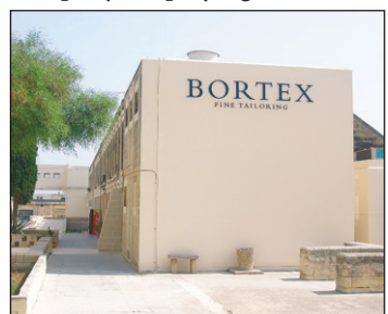
Bortex Plant: Closes for Maltese, opens for Chinese

News that the Chinese-owned Leisure Clothing Company – a company employing a sizeable